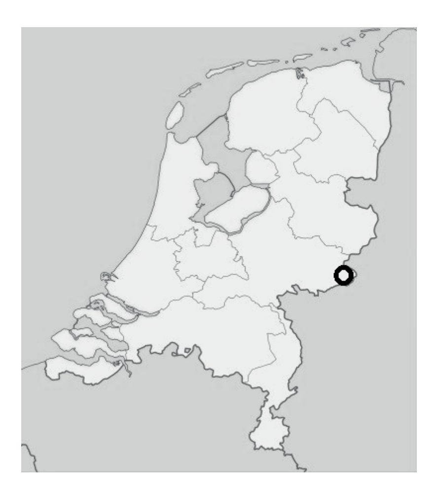
Figura 1 - Winterswijk, na zona este da Holanda.

on the outside and 2 on the inside and so it is possible to see the direct surroundings of the nest and also observe breeding and prey supply. The cameras are online from the beginning of March until the beginning of July, 24 hours per day, 7 days per week. They register the complete breeding season, from courtship and egg laying till hatching and fledging. The footage is not only being watched by tens of thousands enthusiastic spectators, but is also digitally stored and available to download as MP4 for the staff and a selected group of volunteers. They can watch the footage as many times as they like. Prey supply is meticulously registered by a group of experienced volun-