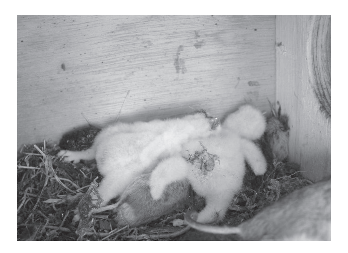
Imagem 1 - Juvenis mortos sobre uma pilha de micromamíferos.

inen 2012), the female does not desert the nest until the nestlings are 3 to 4 weeks old (Eldegard & Sonerud 2009), until they are thermally independent. Also in polyandrous Common Barn-owls ( Tyto alba ) the female deserts her first brood no sooner than that the male is capable of raising the nestlings by himself (Béziers & Roulin 2015).