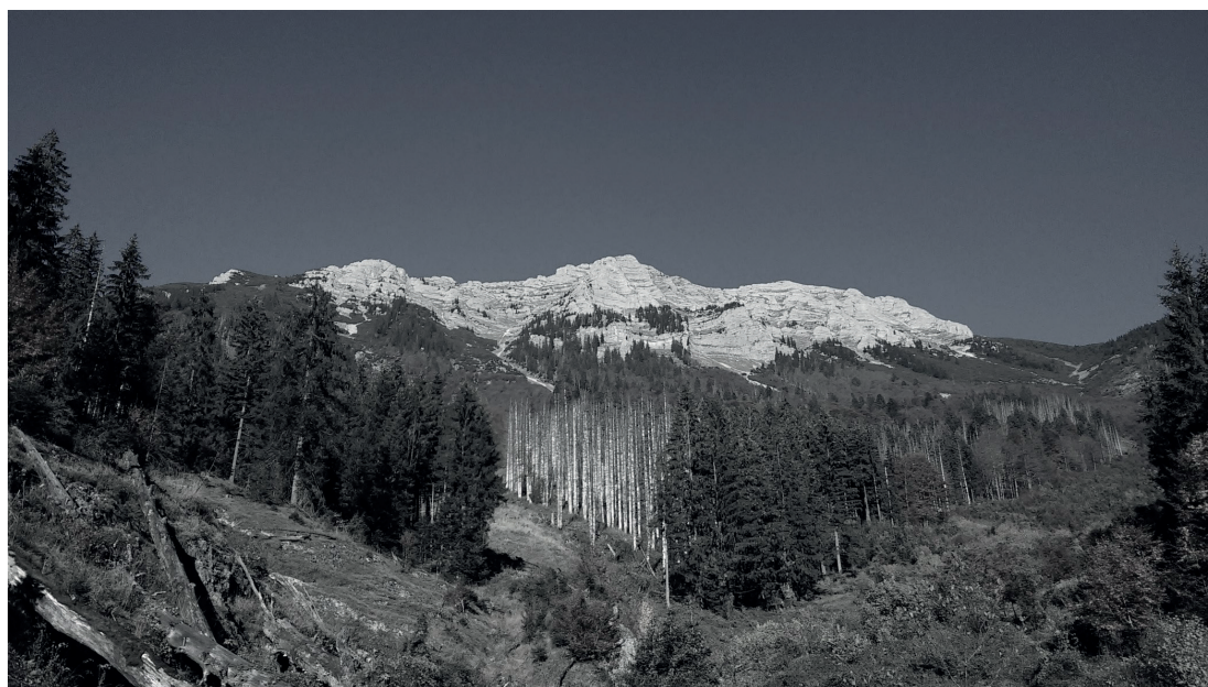
Figura 1 - Área Silvestre de Dürrenstein – categoria Ia (Reserva Natural Estrita) e Ib (Área Silvestre) da IUCN e Sítio Património Mundial da UNESCO, vista para a montanha de Dürrenstein, 1.893 m.

ing that a well-functioning tracking system was required. Telemetry enabled the determination of survival rates, dispersal timing and distances, habitat analyses, territory analyses, enabled the finding of nests in natural tree holes, and confirmed that owls were traveling between the two release areas and the broader regional populations. Based on the locations/territories of the owls, a network of nest boxes was established. The use of nest boxes pursued two main goals: a) compensate for the lack of natural breeding cavities, and b) provided a means of more readily monitoring the nesting success of the owls.