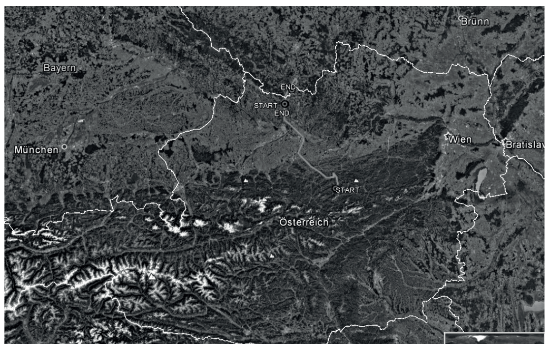
Figura 10 - Rota de dispersão de 150 km de um juvenil de coruja dos Urales libertado em julho de 2017 na Área Silvestre de Dürrenstein (Áustria), migrando em agosto de 2017 e atingindo a Floresta da Boêmia (República Checa) no início de setembro de 2017.