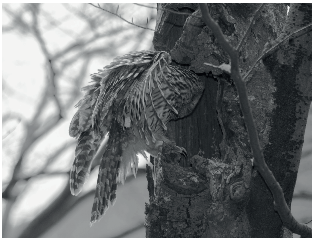
Figura 6 - Fêmea de coruja dos Urales com emissor GPS-GSM com a sua primeira ninhada, numa cavidade natural encontrada pela primeira vez em 2014.

120 days. As a result, no owls visited the feeding table and a mortality rate of 67% (6 of 9 birds) was recorded. Additionally, making the survival situation even more difficult that year, was that the small rodent population was at a minimum. The release strategy was changed in the following years and survival rates from 2010 and after increased significantly (Leditznig & Kohl 2013, Leditznig 2013). Releases of owls that were 90 days of age (depending on the hatching date, between mid-June and end of July), resulted in over-winter survival rates of about 78%. With an age of significantly more than 100 days at release, this value decreased to about