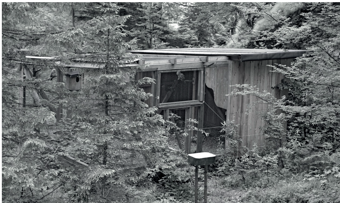
Figura 3 - Um dos dois aviários para libertação na Área Silvestre de Dürrenstein.