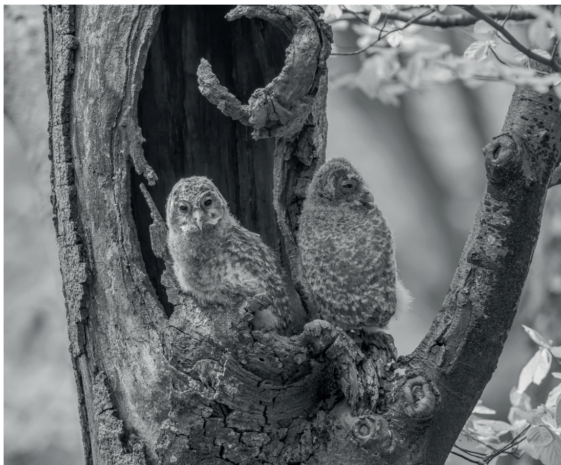
Figura 7 - Quatro juvenis foram criados com sucesso nesta cavidade natural. Apenas foi possível encontrar ninhadas de coruja dos Urales em cavidades naturais através do uso da telemetria (foto: Christoph Leditznig).

2014 started breeding about 27 April 2015. The female owl left the release area on the 25 September 2014 and moved to the south-east edge of the Kalkalpen National Park. The bird stayed there until 9 March 2015. Then she moved to Maria Seesal where she stayed one day before returning to Kalkalpen National Park on the 17 March. She left the Park on the 10 April to arrive in the final breeding area on 12 April (the linear distance between the Kalkalpen National Park and the breeding area was about 40 km). The start of