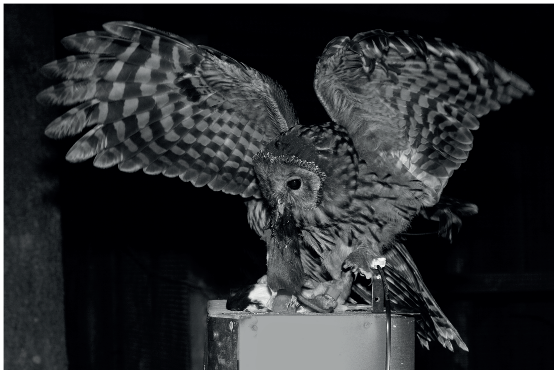
Figura 4 - Juvenil de coruja dos Urales na mesa de alimentação (foto: Christoph Leditznig).

important habitat for some owl species (e.g., Boreal Owl Aegolius funereus ) as well as for woodpecker species (e.g., White-backed Woodpecker Dendrocopos leucotos ). Geologically it is part of the Northern Limestone Alps with an annual precipitation of 1,700 to 2,400 mm. The topography is steep and mountainous.