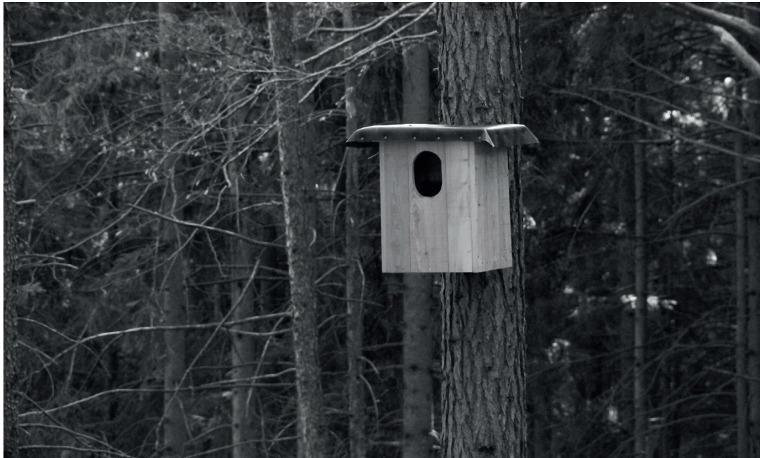
Figura 5 - Caixa-ninho em madeira de pinheiro-negro, com 40 x 40 x 60 cm e 25 kg, a uma altura de cerca de 5 m.

Different monitoring tools were implemented to survey the success of the project: telemetry, camera traps, light barriers in combination with cameras, monitoring of nest boxes, ringing, genetics, call surveys and direct sightings. During the breeding season all nest boxes, often in steep terrain with snow cover, are visited with a telescope stick and a camera (photo camera or video camera) for monitoring the breeding status of the Ural Owls. The genetic analyses was carried out by the Research Institute of Wildlife Ecology (FIWI).